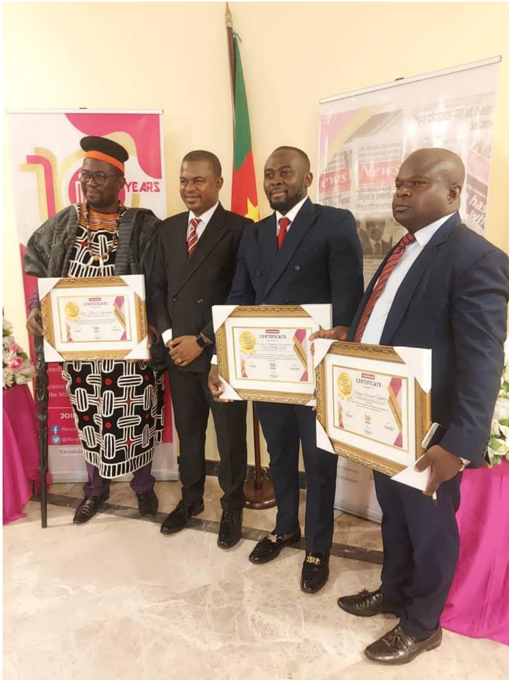
Caption: PROSDOMA's leadership recognized for regional sustainable development leadership.