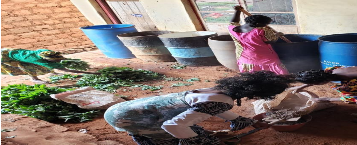
The above two pictures: Training of women on organic fertilizer production in Ndu town.