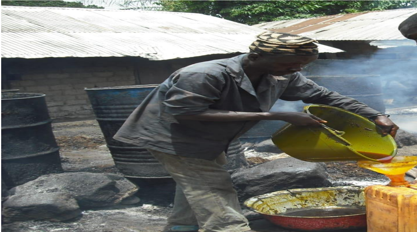
Above pictures are from Ako oil press machine. (old but functions good)

how to produce starch from the waste water which can be an additional value. In addition, the Ministry of Planning and Regional Development, donated a corn mill which PROSDOMA installed in Nkambe, for its members and the general use of the population.