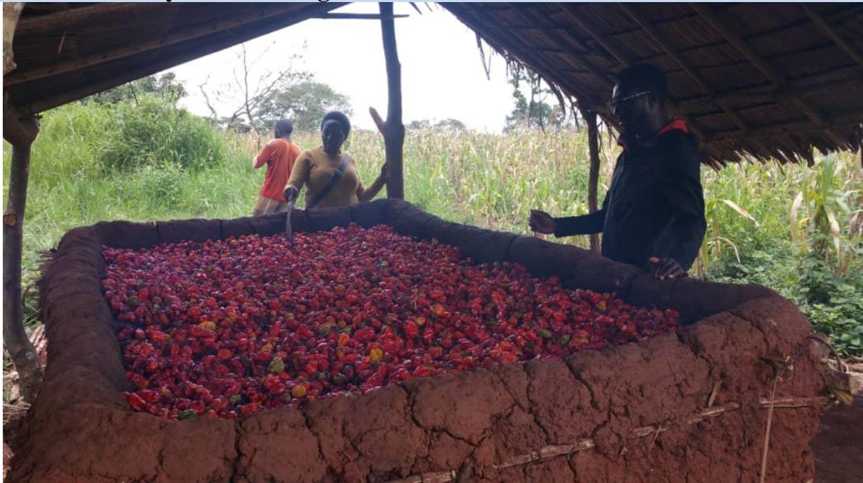
Drying of Hot Pepper with the use of an Oven by our famers

This program benefitted support from the Ministry of Agriculture and Rural Development. The Ministry donated to PROSDOMA, a mini oil processing mill worth 3.5 million FCFA which will be transported to the site for installation in the months ahead. This is in addition to two existing old mini oil mill which can be seen below. The program worked on two speculations, cassava and palm oil. The quality of produce which was obtained was very encouraging. The Asaka Cassava farm was able to put into the market its first produce and byproduce. Processing cassava to 'Gari' and water fufu and we are now seeking partnership to empower farmers on