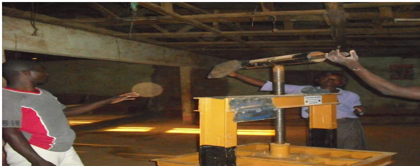
The Above two pics are related to Abuenshie Cassava processing Mill

Results: In all, 60 bags of ‘Gari’ were produced and the 300 kilograms of water fufu. In Ako, majority of the group and farmers are involved in cultivation of oil palms and PROSDOMA Mini Oil Press produced 35.000 liters of oil. The Abuenshie Mini Processing oil mill entered into production in April, and by December 31, it had processed 14.000 liters of oil.