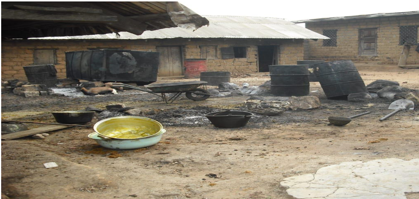
Pictural view of Ako Palm oil Processing Factory.